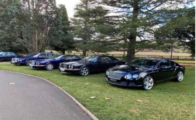
A selection of Members cars adorning the carpark at Bendooley Estate