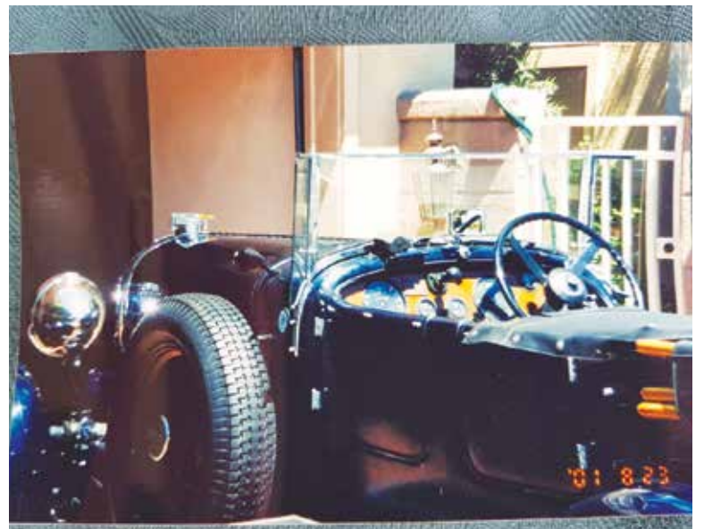
ABOVE: it's interesting to note how the design of vehicles have changed, in terms of where the spare tyre is kept. Vehicles such as these were able to mount them on the side guard behind the front wheel.