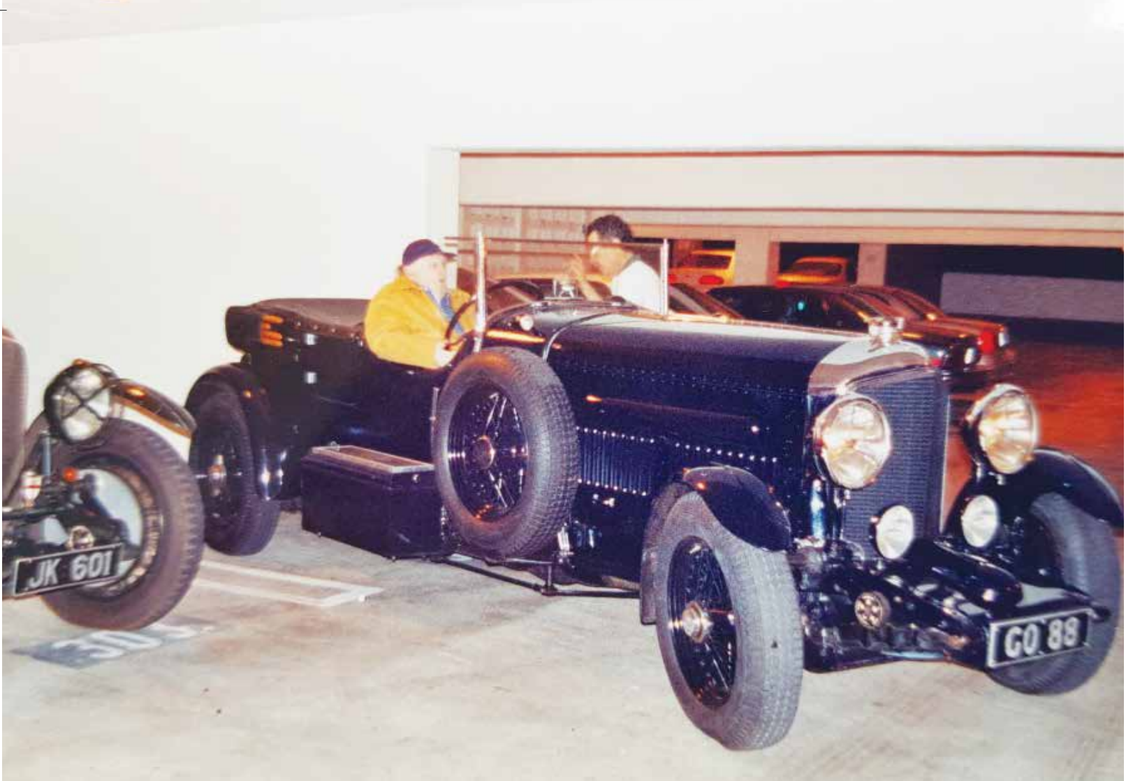
ABOVE: The 8-litre on display is just as exciting as when it's on the open road. Classic vehicles like this have a true presence whether in motion or static.