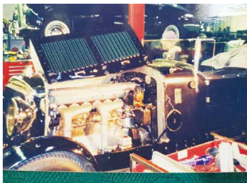
ABOVE: a close-up of the famous 8-litre engine - a magnificent sight any for car enthusiast.