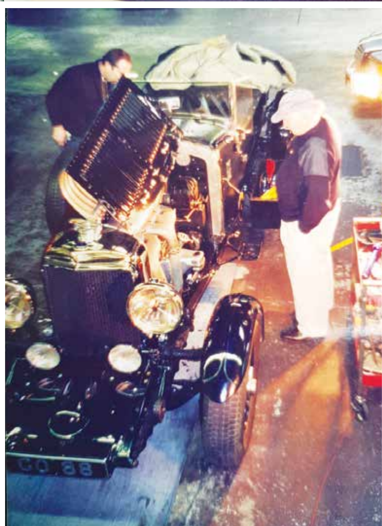
ABOVE: an aerial view of the 8-litre in the workshop.